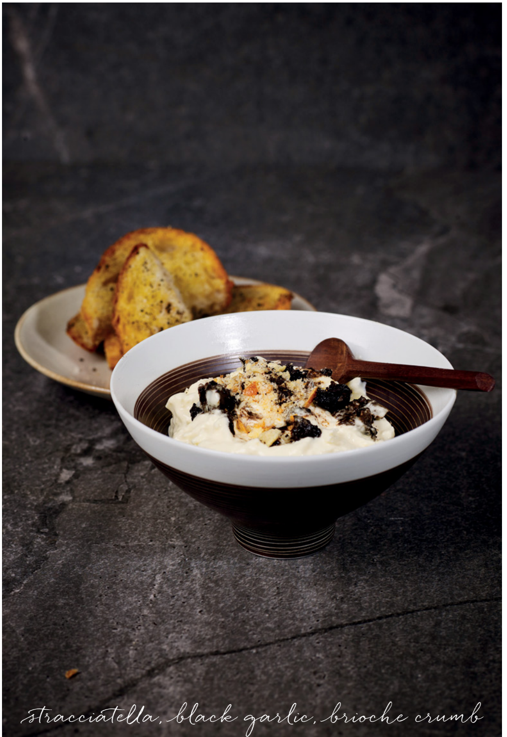
stracciatella, black garlic, brioche crumb