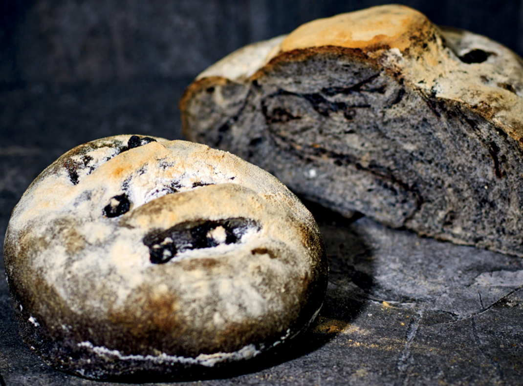
black garlic sour dough bread