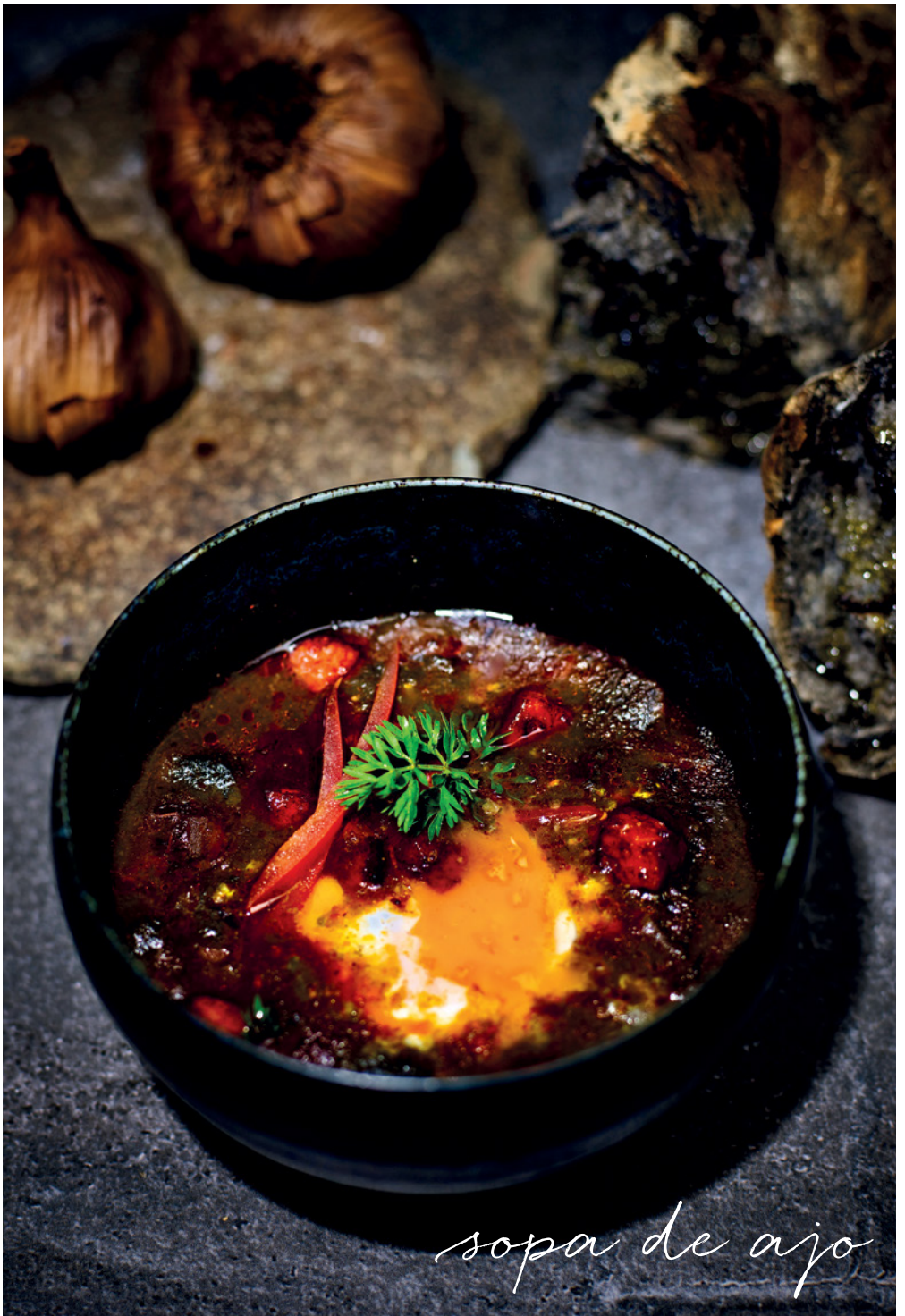
sopa de ajo