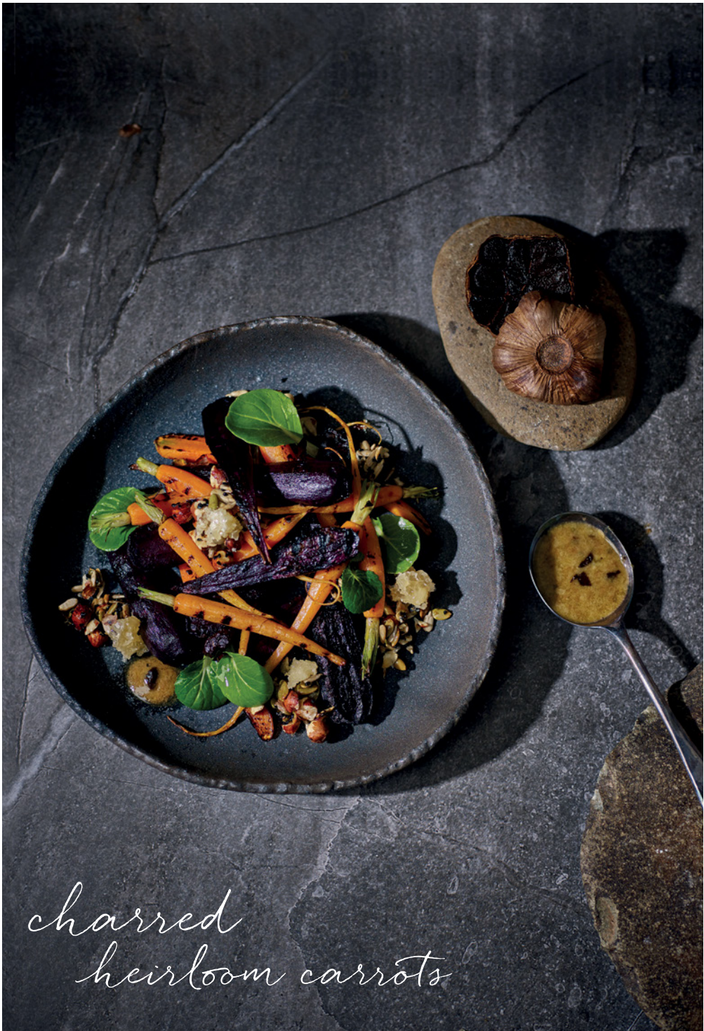
charred heirloom carrots