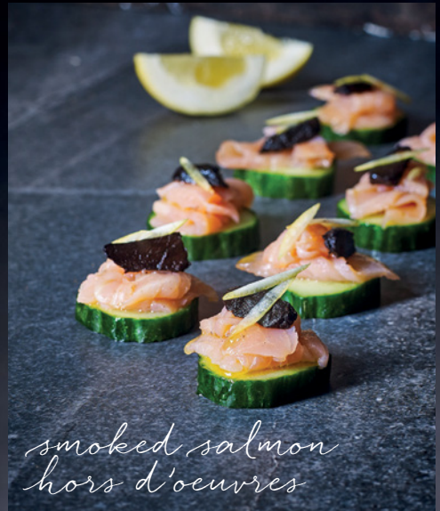
smoked salmon hors d'oeuvres

Spread a generous amount of cream cheese over slices of ciabatta, top with cured ocean trout slices, pickled onion and season with black garlic powder, top with dill sprigs.