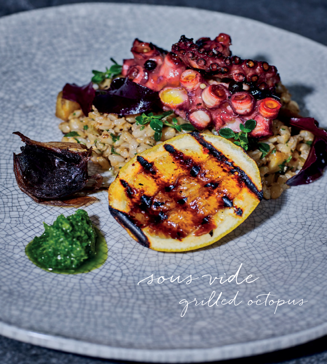
sous vide grilled octopus