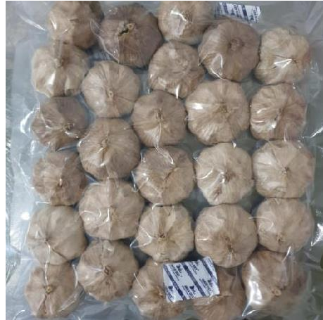
Unbranded White label / Private label