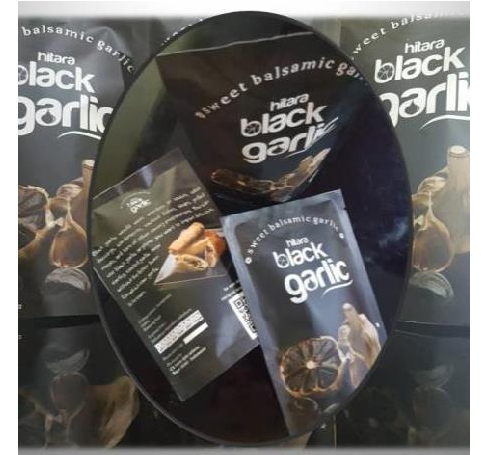
Pouch 150g, 100g, 20g