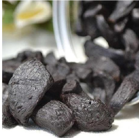
Black Garlic Peeled