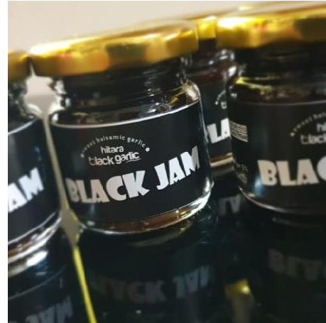
Black Garlic Paste/ Puree/ Jam